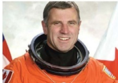
Dr. Dave Williams Record-breaking Astronaut, Aquanaut & Leadership Expert